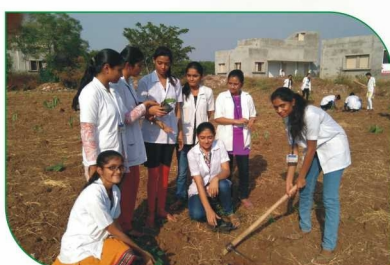
NSS tree plantation