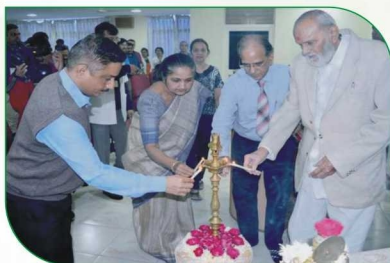
CME in Dravyaguna