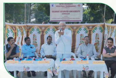
Intercollege Volleyball Tournament 2017