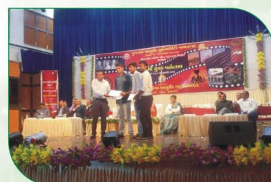
Youth Festival Winners