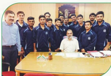
Inter University Kabaddi team