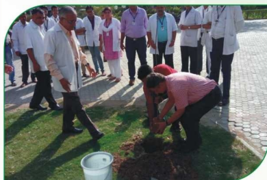
World Environment Day