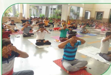
International Yog Day