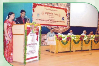
Annual Day 2017