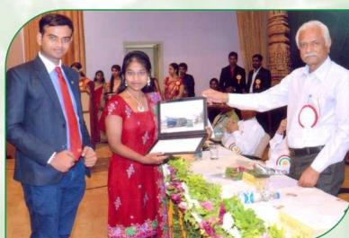
Annual Day 2017