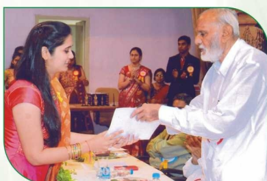
Annual Day 2017