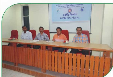
NSS camp inauguration