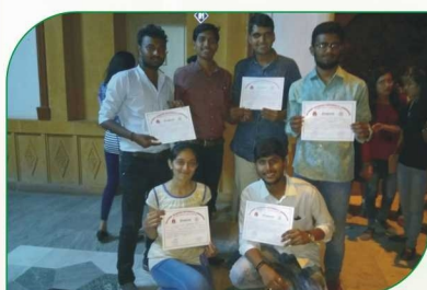
Youth Festival winners