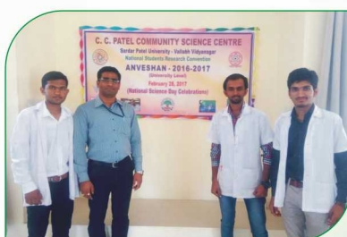
Winning team at Anveshan 2017