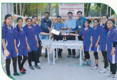
Intercollege Volleyball Champions